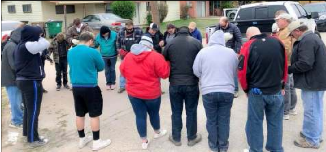
Downtown Lions and friends praying before getting started on their project.