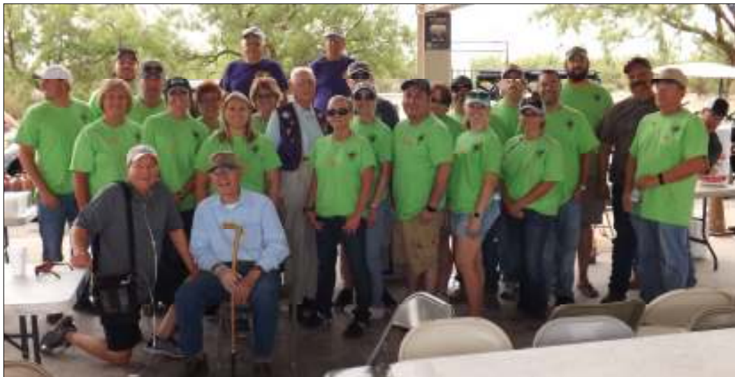
A great big thanks to all the volunteers who helped make our shoot a huge success!