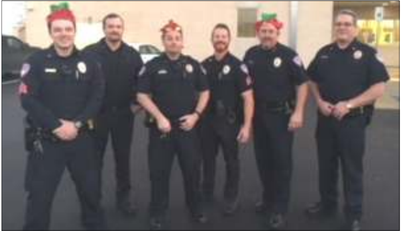
San Angelo Police Officers taking time from their busy schedules to help with the party.