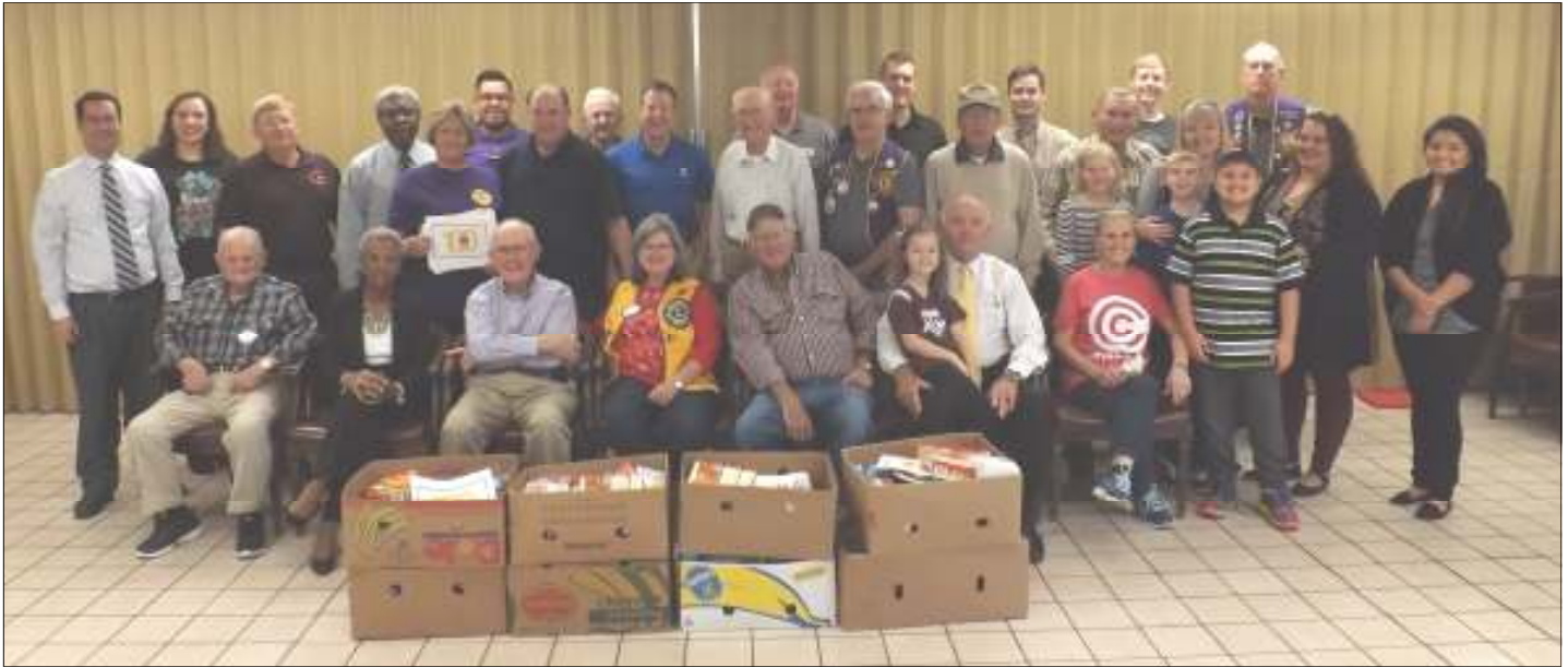
Members and guests (many of them children and grandchildren) who helped put together and deliver 35 boxes of food for families in need of food for this Christmas season.