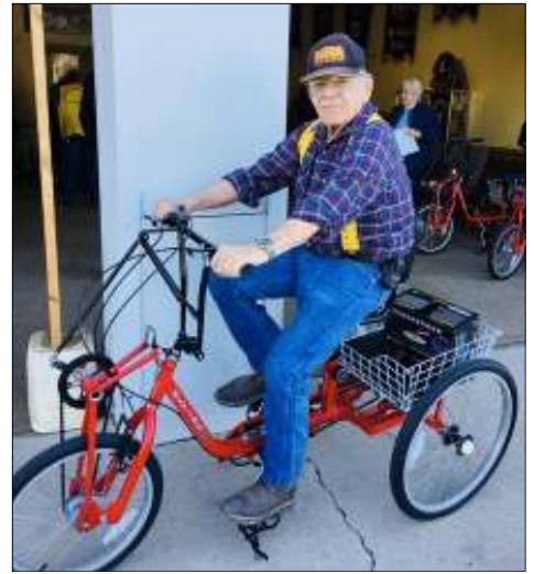
A person getting used to his new means of transportation.