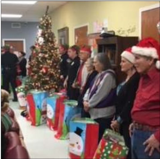
Downtown Lions and Police Officers ready to hand out presents to the children and adults at the Shelter.