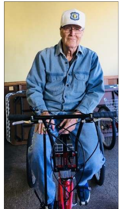
A recipient fixing to try out his new cycle.