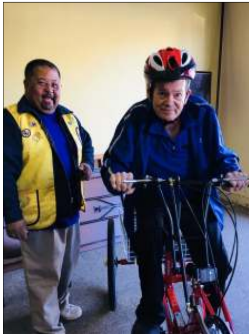
A member of the Southside Lions helps a recipient adjust to his new cycle.