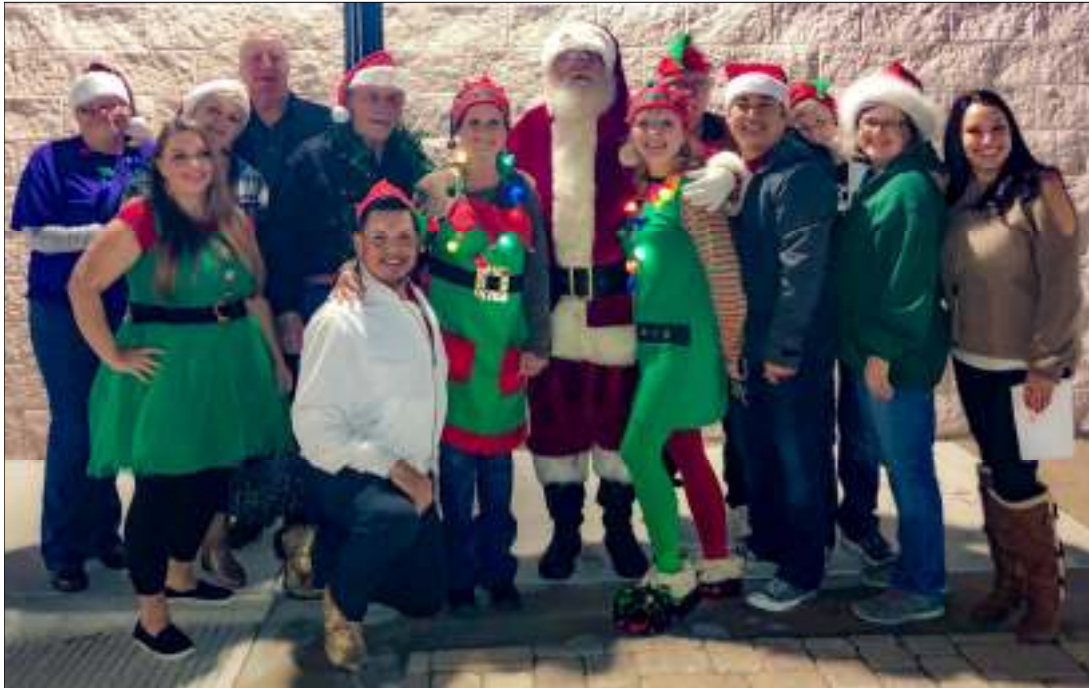
Our members getting ready to enter the Family Emergency Shelter to give presents to the adults and children.