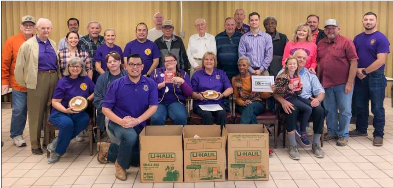
Our club prepared and delivered 36 Christmas baskets filled with food to less fortunate families on Thursday, December 20. Instead of a regular noon meeting, these members met to prepare the baskets and then take them to the families.