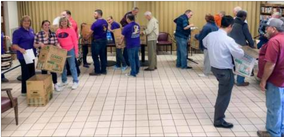
Members grab a box and go thru the assembly line to get different food items. Due to the number of members and efficiency of the line, it took about 20 minutes to assemble the boxes.