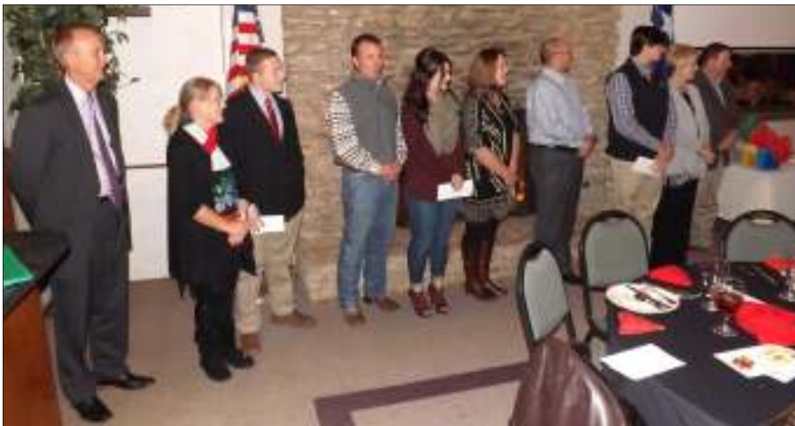
Our Outstanding Youth Contestants and their parents after the presenting of the checks.