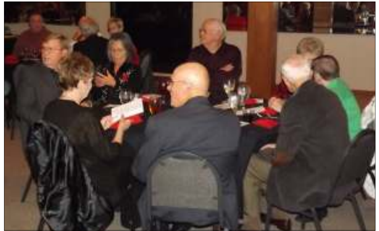
Downtown Lions and guests getting ready for the festivities.