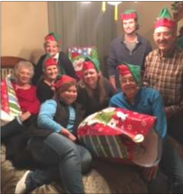
Our club members getting into the Christmas Spirit at the Family Shelter.