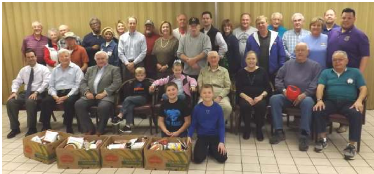
Our club members (and some younger future Lions) got together to load up over 30 Christmas boxes for those in need for this Christmas.