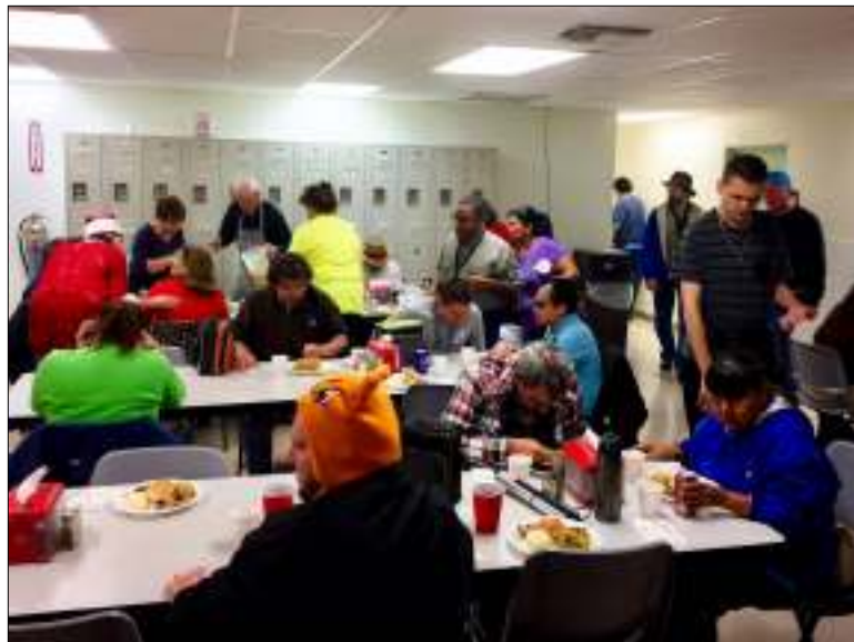
Above: The employees and staff enjoying the traditional Christmas meal.