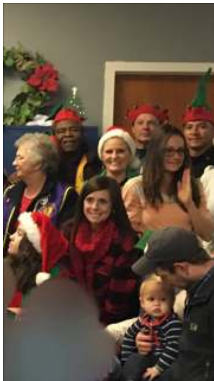
More of our members and even non-Lions who helped make the event a success.