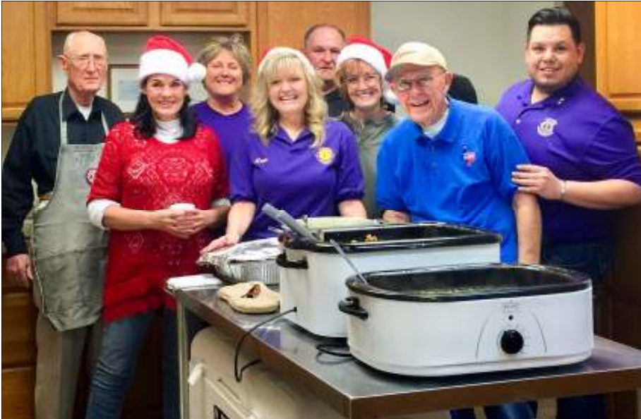
Our members getting the food ready to serve.